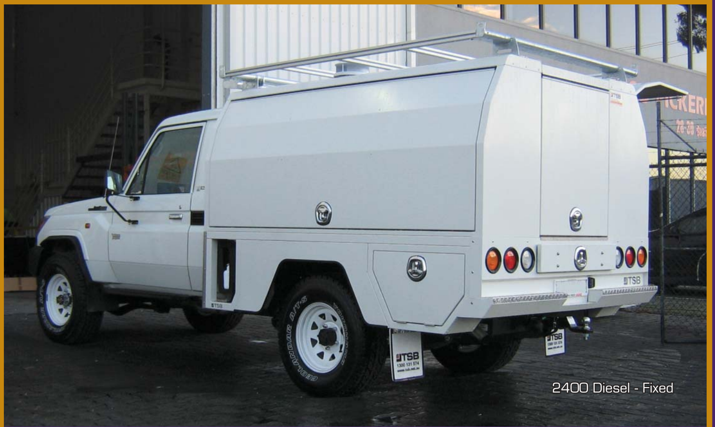
2400 Diesel - Fixed