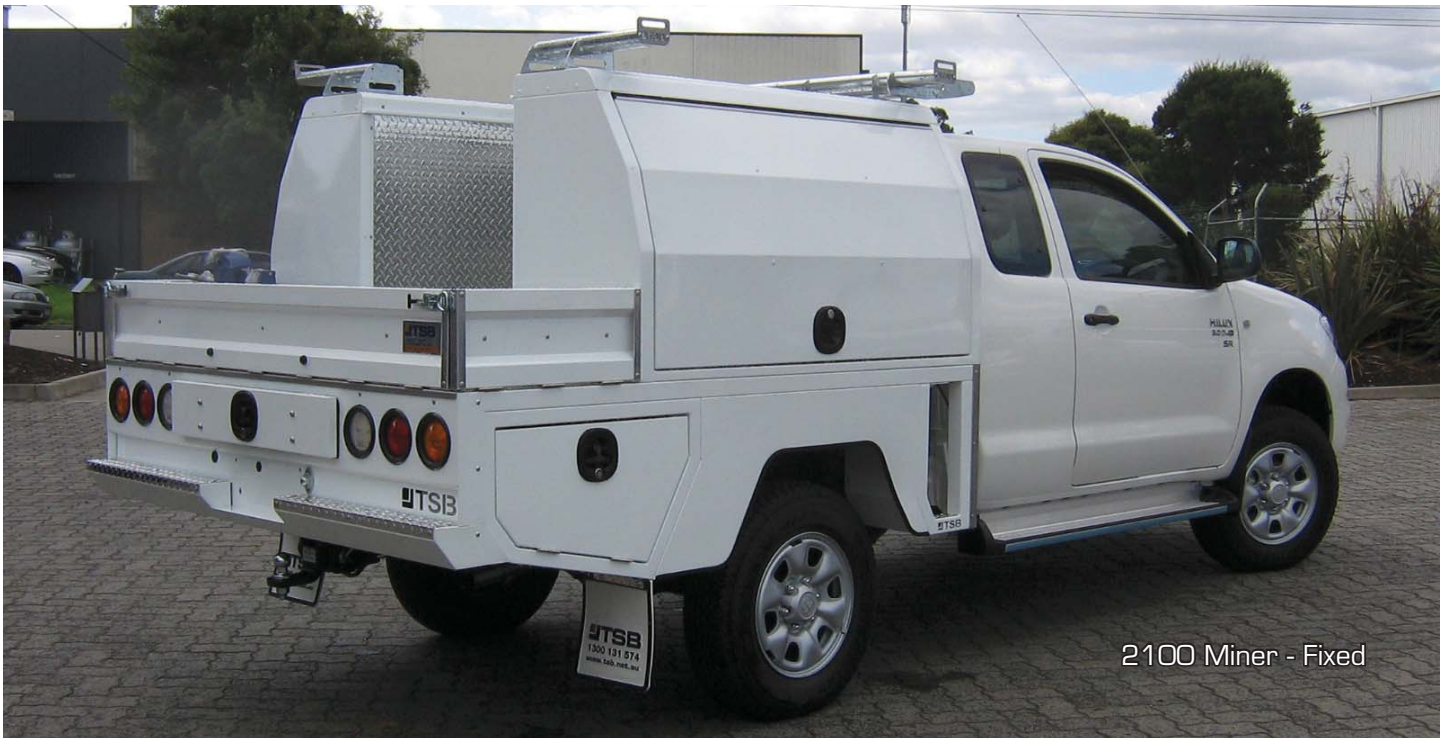
2100 Miner - Fixed

A Division of Actco Pickering Metal Industries P/L