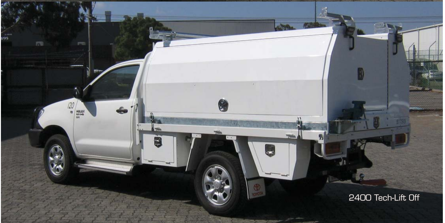
2400 Tech-Lift Off