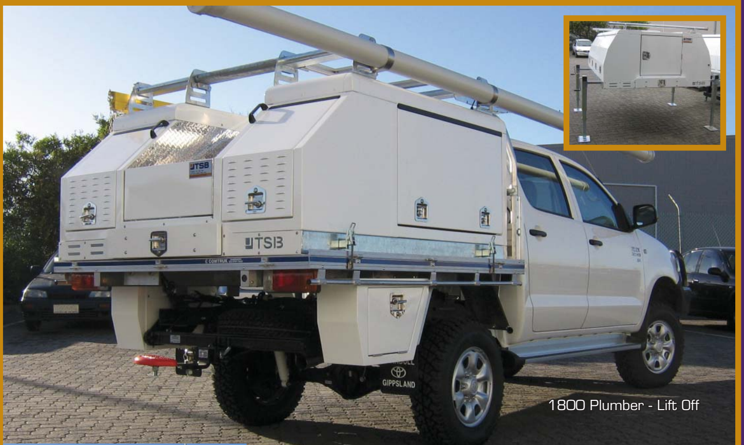
1800 Plumber - Lift Off